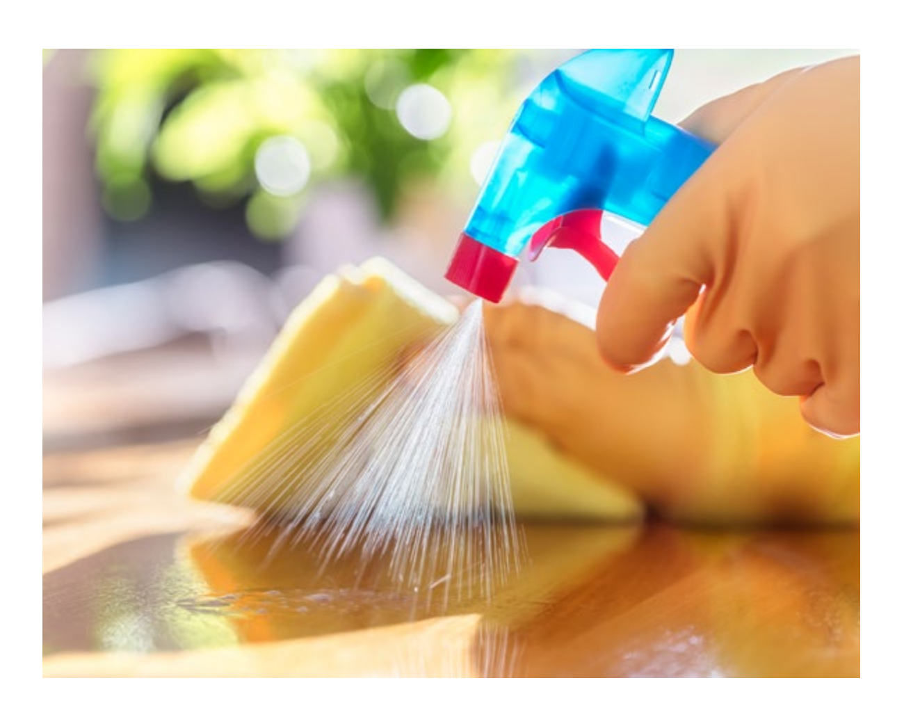
cleaning, disinfecting & maintenance